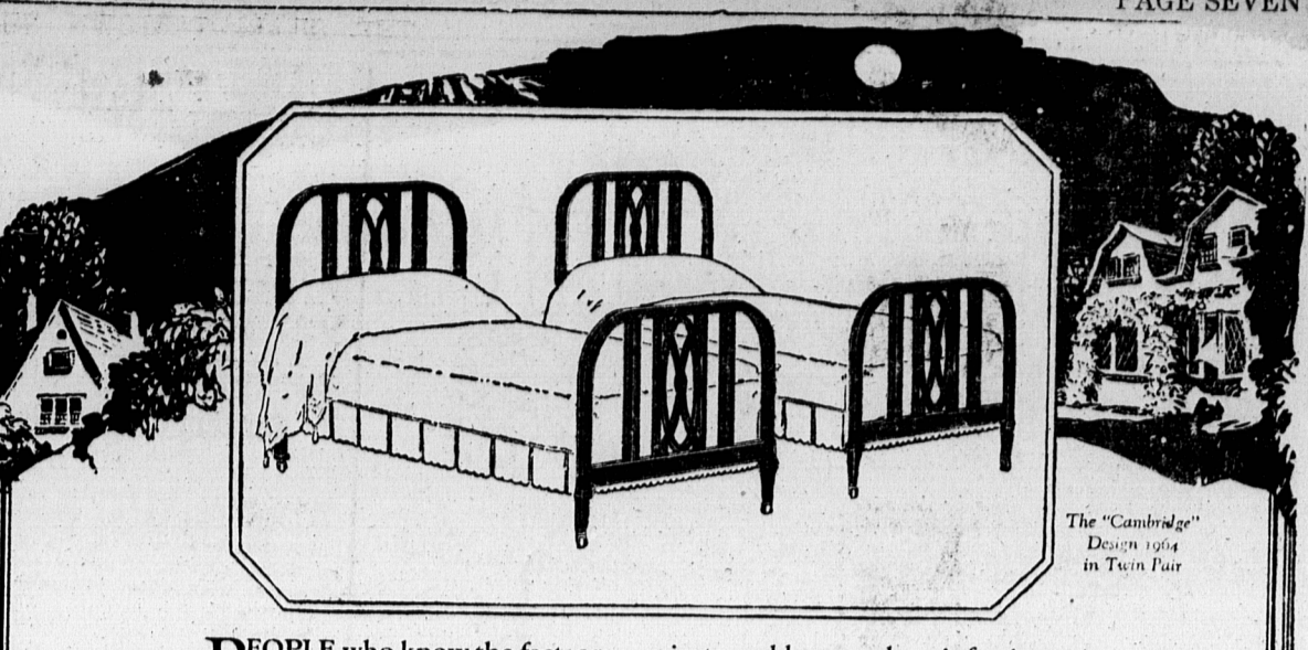
The "Cambridge" Design 1914 in Twin Pair