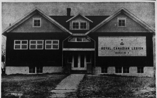
MONTAGUE'S NEW LEGION HOME

FLIGHT ATTEMPT Man's earliest attempt at flight in historical times began with the hot air balloon in 1783. ST. JOHN'S, Nfld. (CP)—The faced with plastic and glass new look is spreading over this oldest city in North America. Steel and concrete buildings John's