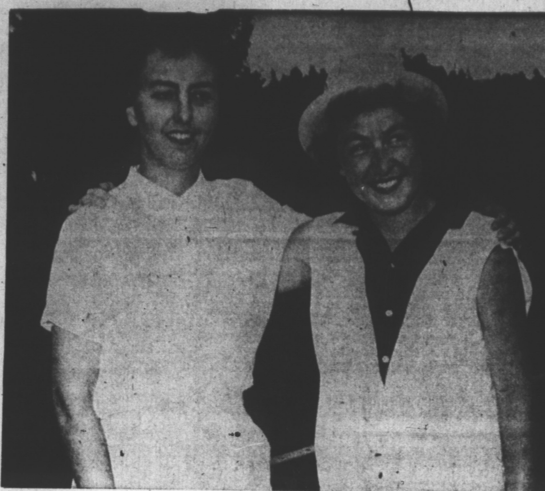
FINALISTS MEET TODAY