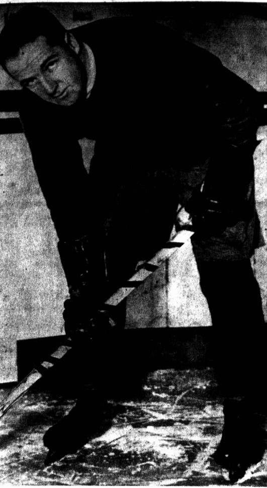
CLEGHORN STORY ENDED

A young blue whale, when the hunting is good, can put on 200 to 300 pounds of weight a day.