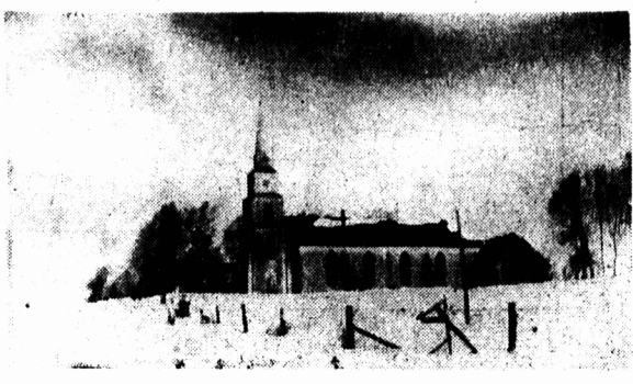
Pictured during mid-winter is the third church of St. George's, destroyed by fire Easter Sunday, April 25, 1943.