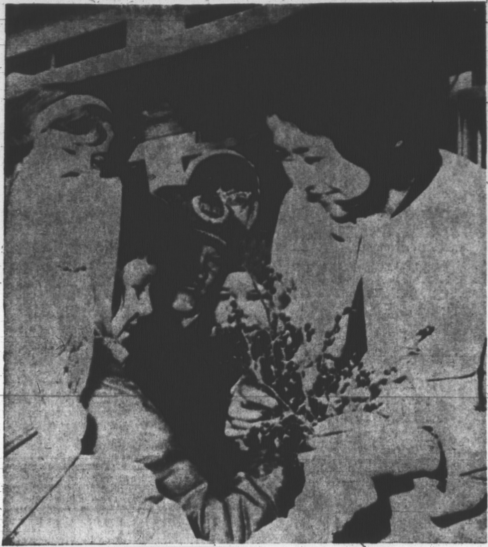
SURROUNDED BY CHILDREN