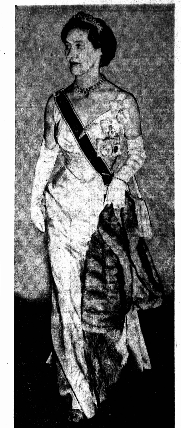
Lovely in a silver brocade gown adorned with medallions of the Royal Family at the shoulder, Princess Margaret is seen as she arrived at the Royal Opera house in Covent Garden, London.