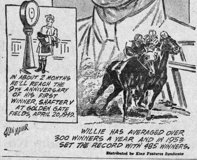
WILLIE HAS AVERAGED OVER 300 WINNERS A YEAR AND IN 1953 SET THE RECORD WITH 485 WINNERS.

WILLIE SHOEMAKER, THE JOCKEY EVER TO RIDE 3,000 WINNERS, BUT AT 26, THE YOUNGEST EVER TO REACH THAT DISTINGUISHED MARK.