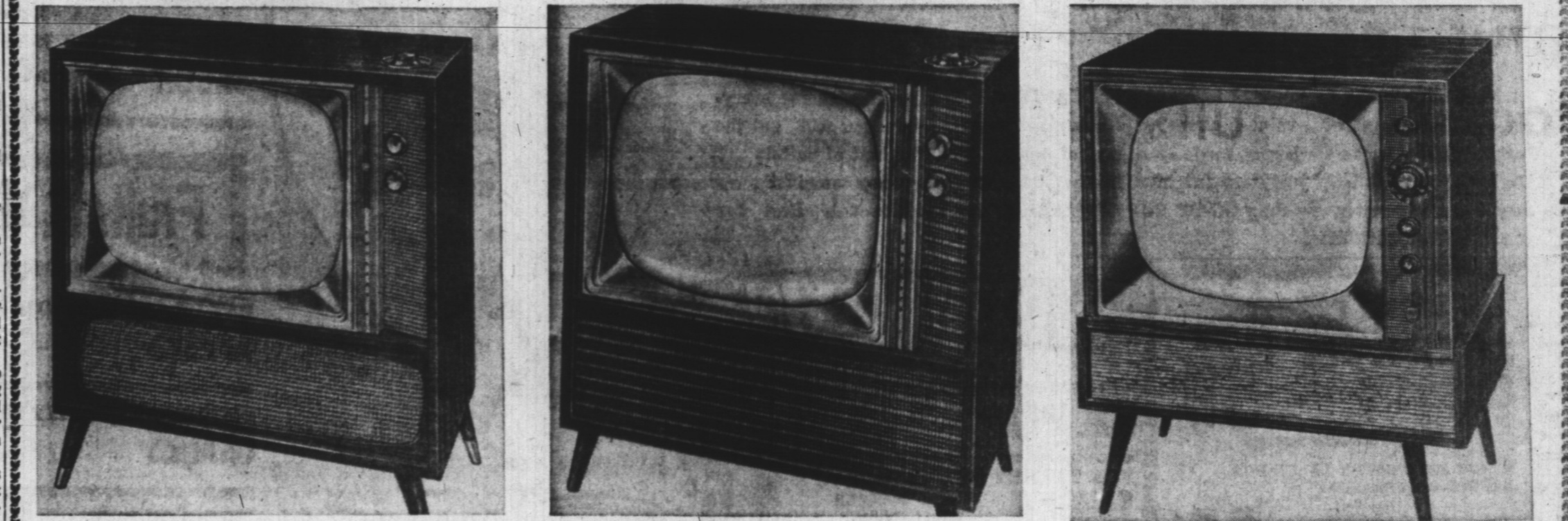
C109 21" CONSOLE: Economy meets quality in rich Walnut, Mahogany and Oak finish cabinets. Front mounted Wide-range 8" Speaker. Super-power "P" Chassis. Fingertip Top-Tuning. Full fidelity sound. Reg. $334.50 Christmas Special $274 21" TABLE MODEL: Quality at a budget price . . . 5" Wide-Range Speaker . . . Super-power . . . finger tip tuning . . . Philips excellence in workmanship . . . legs or base available at small extra cost if required. Reg. $269.95 Christmas Special $244 (Table Model illustrated with base) 17" TABLE MODEL: Philips quality at lowest price possible . . . 4" high efficiency wide-range speaker . . . Super-power . . . legs or base available at small extra cost if desired . . . ideal for small living-room or den. Reg. $234.95 Christmas Special $209