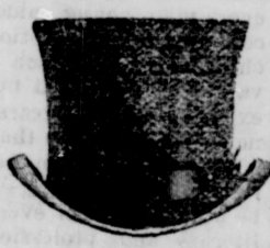
A FINE ASSORTMENT OF

FIRE.—On Sunday morning, the 19th instant, about 6 o'clock, the Lobster Factory of Messrs. McLean Brothers, at High Bank, was noticed to be on fire. The alarm soon spread, and a number of the people of said locality after hard struggling succeeded in quenching the flames; only about ten feet of the bath-house or shed having been destroyed by the fire. The people of High Bank deserve praise for their energy in subduing the conflagration. Cause of the fire unknown. Fortunately the traps and boats were removed out of the premises on Thursday.