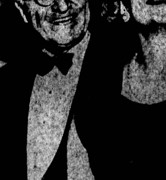
THAT'S MY GAL! — President Truman and his daughter, Margaret, appear in public together for the first time since his now-famous letter to a Washington music critic. The President took his daughter to the National Press Club's annual father-daughter dinner in Washington.

A child born on this day may have many rash, irritating urges and desires to upset its peace of mind with hapless reactions on its private, social, or domestic relations.