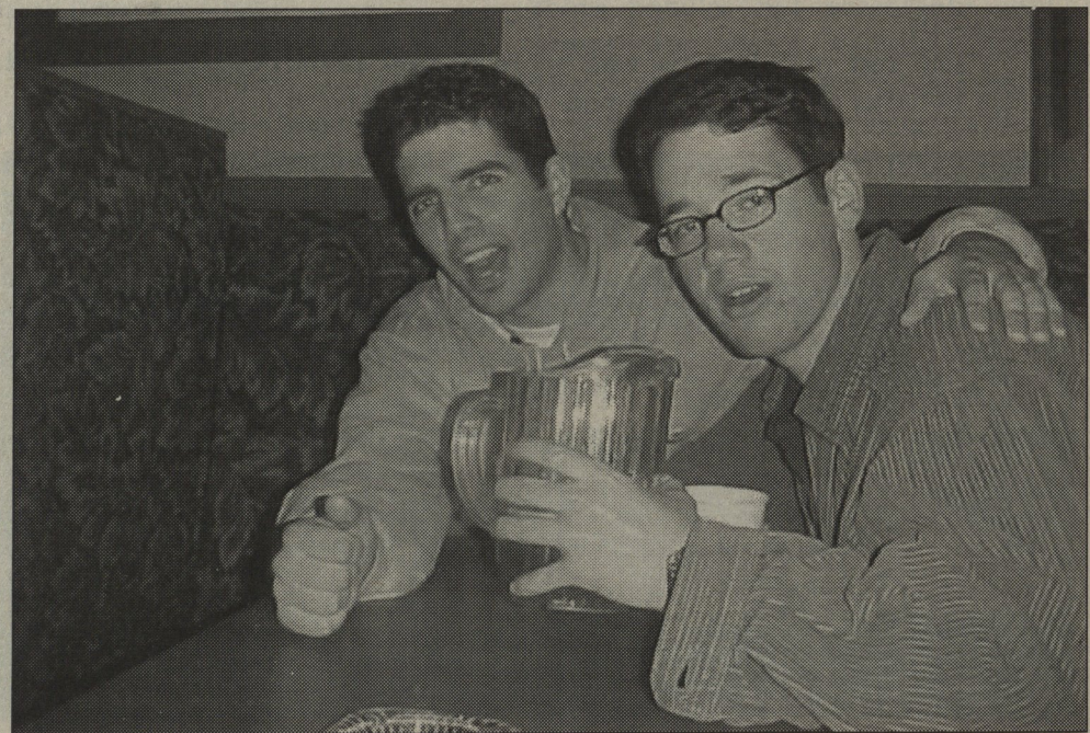
"Yo Bomb, check out the middle-aged honey playin' the VLT."