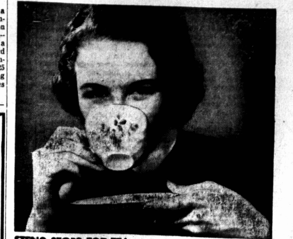
STENO STOPS FOR TEA —A few minutes break, with a cup of refreshing Tea and she's all set to go again.