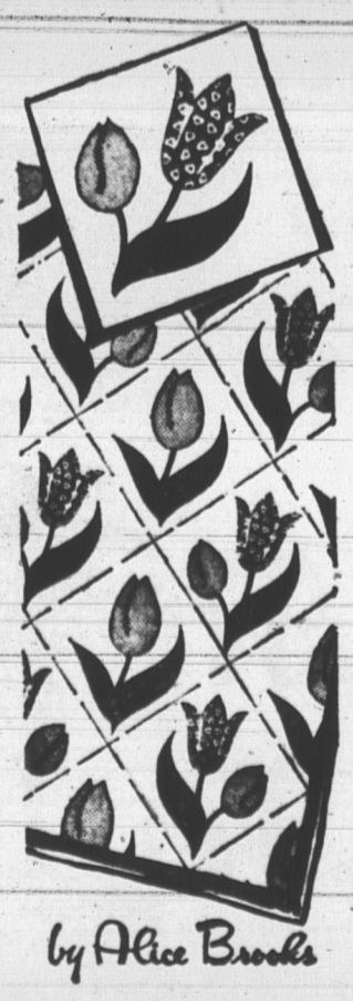
by Alice Brooks TULIP GARDEN

Fashion's newest skirting is a front wrap with buttons on the double and a split side swing. Marvellous shape with skirts, sweaters, easy jackets.