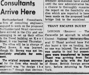
THANT ESCAPES INJURY

THANT ESCAPES INJURY LONDON (Reuters) — The Caravelle jet aircraft in which United Nations Secretary-General U Thant arrived here Friday burst a tire on landing, but no one was injured. The aircraft was unable to taxi but passengers were transferred to buses. Thant was arriving from Belgrade for talks with the Field of Home, British foreign secretary, before returning to New York.