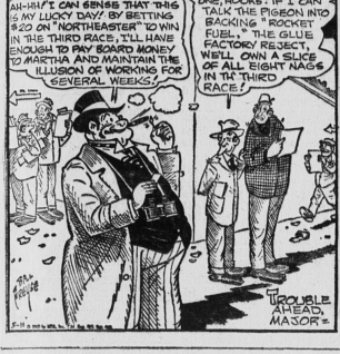
OUR BOARDING HOUSE MAJOR HOOPLE