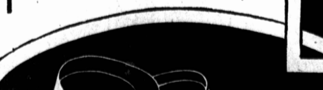
Lo-Cuban Wedge... trickily sculptured vamp with wish two-buckle breeziness. $2.98.

Summertime is Sandaltime at... Agnew-Surpass MORE THAN 100 STORES COAST TO COAST IN CANADA 122 KENT STREET IN HIGH-STYLED SHOES NO GREATER SELECTION AT POPULAR PRICES ANYWHERE