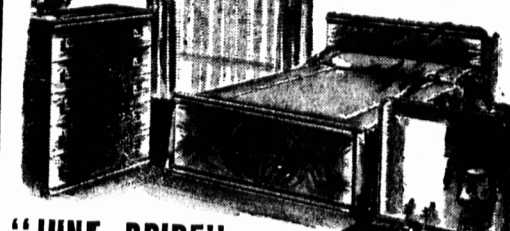
"JUNE BRIDE" BEDROOM BARGAINS

LOW PRICED 3-Pc. SUITE In walnut, blonde or medium walnut finishes. Dresser, chest and bed. JUNE SPECIAL 99.50 60¢ or wkly.