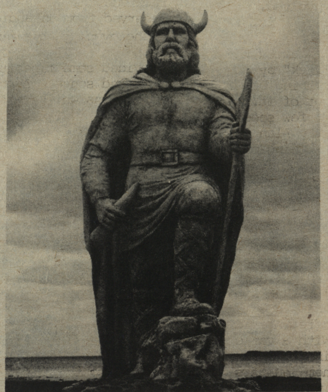
third place