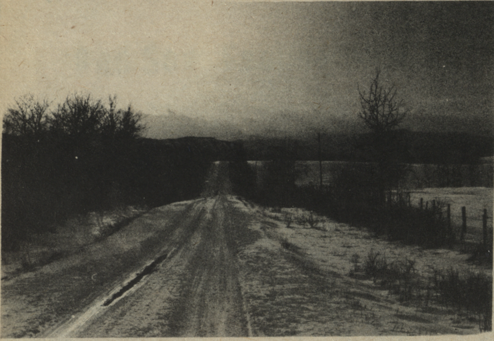
first place