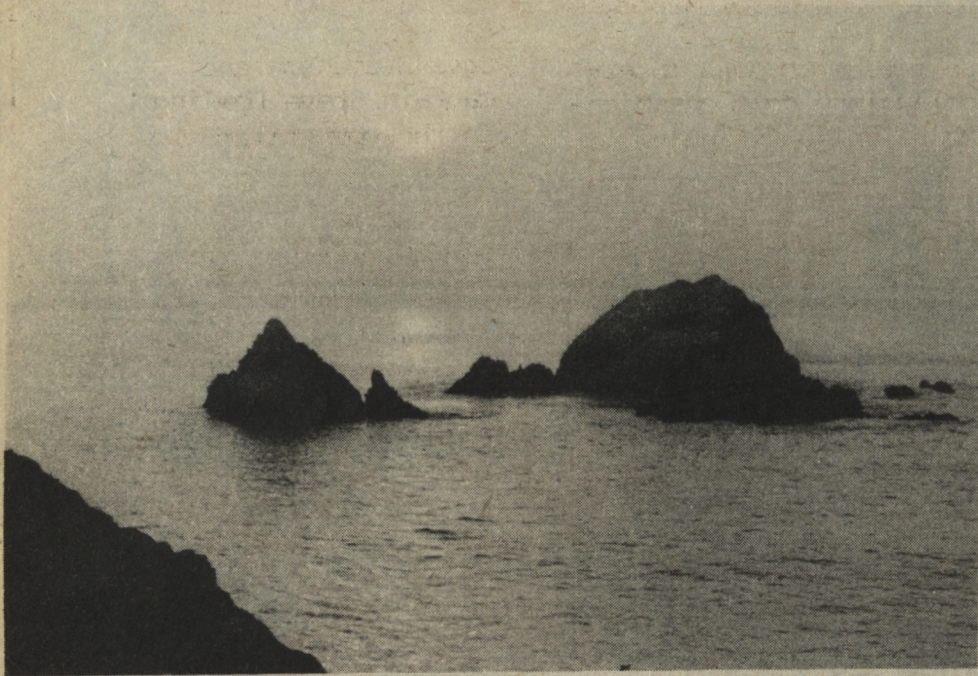
second place

The U.P.E.I. Photo Club is off to a great start. The success of the first contest is an indication of more to come.