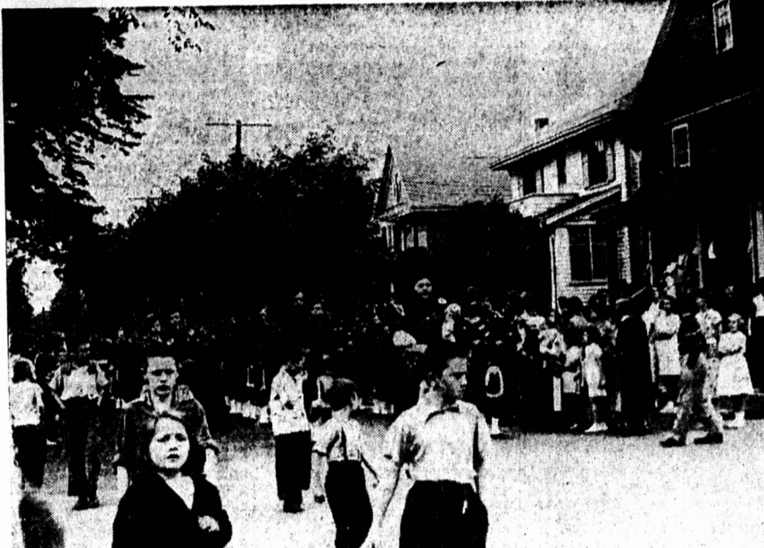
Massed Highland bands lead the colorful parade.