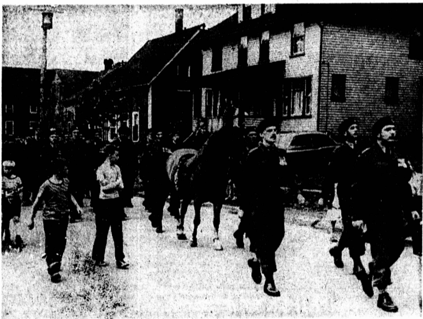
A detachment from the famous 8th New Brunswick Hussars with their Mascot "Princess" adopted in the Italian Campaign.