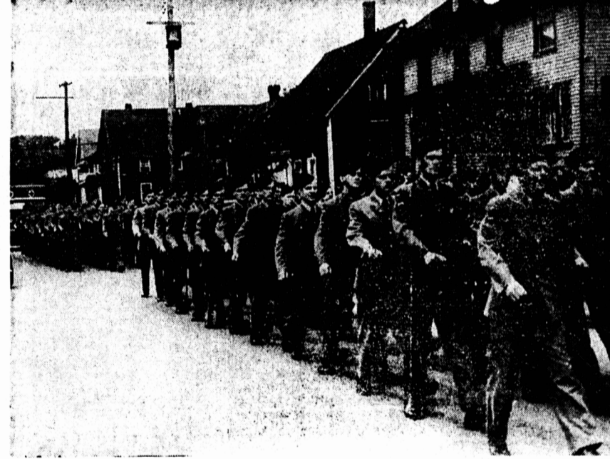
Smartly stepping members of the R.C.A.F. who came from their station at Summerside to take part in the Parade.