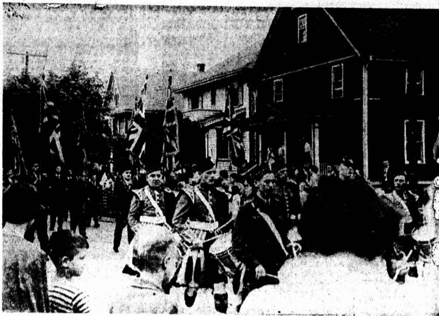
Veterans Parade behind Legion Colors.