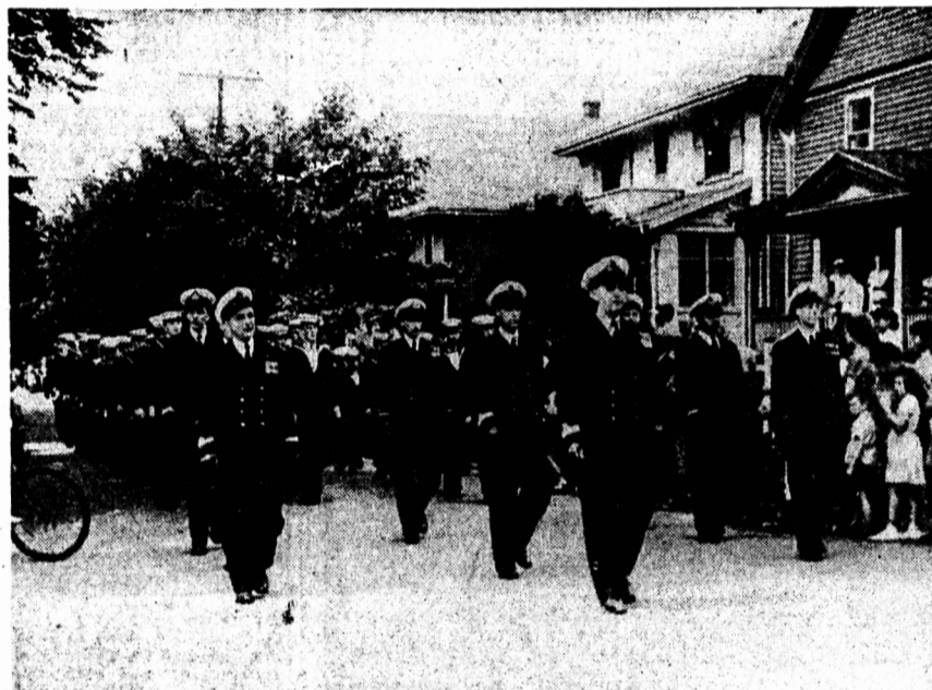
A detachment from the Royal Canadian Navy (Reserve).

NOKOMIS, Sask. — (CP) — The Canadian Legion Branch here had to reorganize when membership dropped to two men.