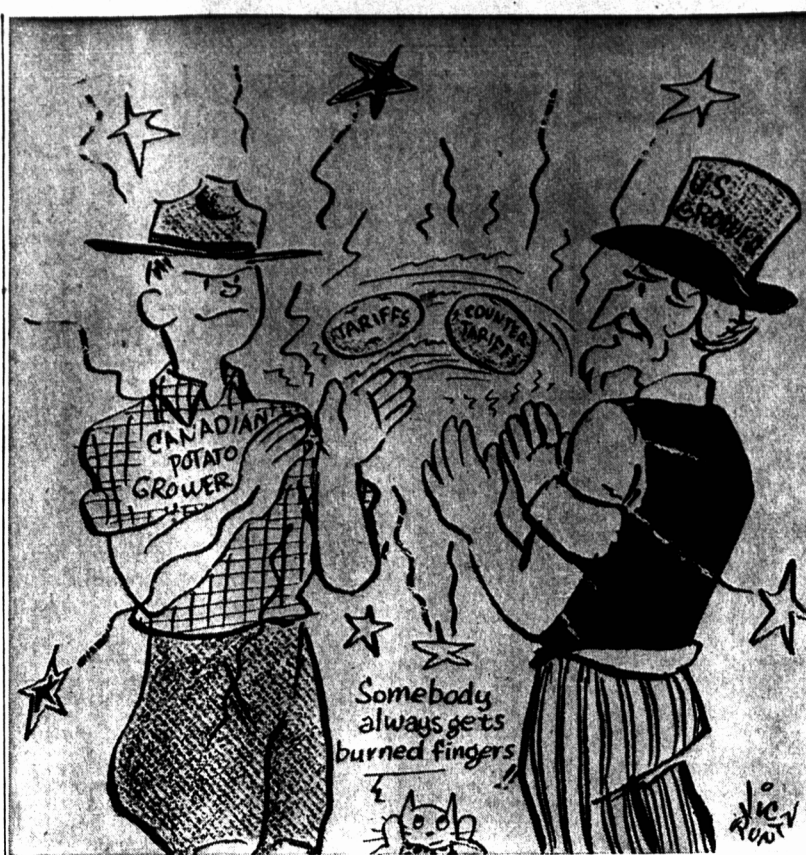
Hot Potato Game

Premier Douglas of Saskatchewan may be drafted as national leader of the CCF before the 1957 general election campaign, says the Winnipeg Free Press. It is known that Mr. Coldwell, the present CCF leader, is not in the best of health and it is possible that he may leave public life at the end of the present Parliament. The CCF group in the Commons is alarmed at the prospect of losing Mr. Coldwell, who is an outstanding parliamentarian. They believe Mr. Douglas is the man most likely to replace him.