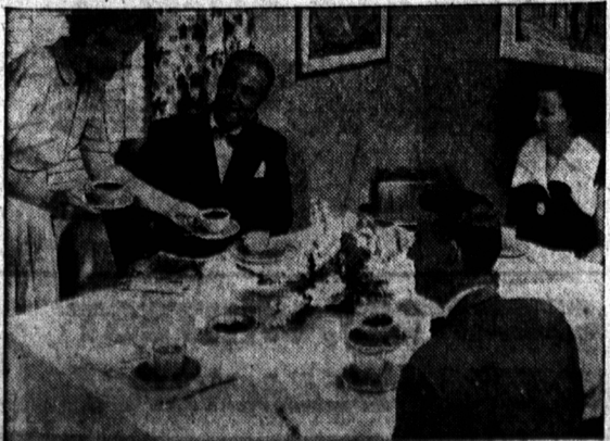
They've switched to new Instant Chase & Sanborn for breakfast and they love it! No more coffee stains or grounds in her modern kitchen.

Yes; this instant coffee is a far cry from the weak, disappointing coffee substitutes. It's potent, full-flavored, 100% real coffee! But there's only one way to prove it. Get a jar of New Instant Chase & Sanborn. Taste that freshly ground coffee flavor—so good you'll make it your regular coffee!