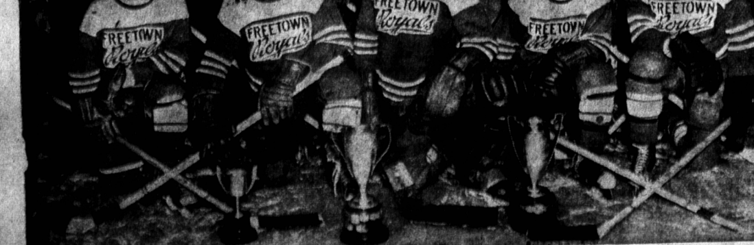
SOUTH SHORE LEAGUE CHAMPS The Freetown Royals (above) won the South Shore League title at Bedeque Rink last night by edging Albany St. Pats 5-3 in the seventh and final game of a hotly contested series.

By THE CANADIAN PRESS Jess Willard won the world heavyweight boxing crown by knocking out Jack Johnson in the 26th round at Havana, 41 years ago today. The giant Willard held the crown four years until he was beaten by Jack Dempsey in a savage fight that lasted only three rounds 8 sat Toledo, Ohio, in 1919.