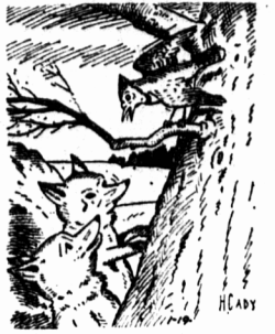
"No," said Sammy Jay and began to chuckle. "He fights with his tail."

"Does he carry those little spears?" asked Soft-Eyes who had been listening.