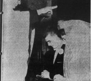
'LOVE IS A COMPLETE GIVING'