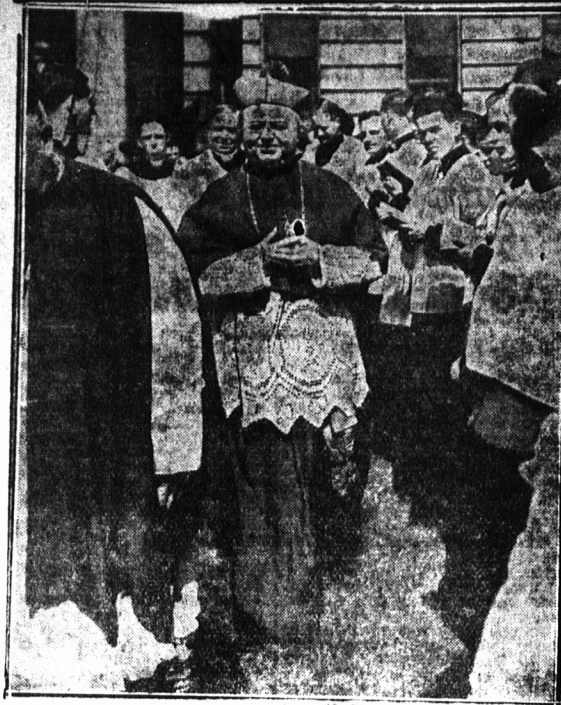
Silver jubilee services of St. Augustine's Seminary, Scarborough, Ont., were attended, May 22, by more than 10,000 people. Praise for the fine work of the institution, the first English-speaking seminary in Canada, was voiced by vicar general...