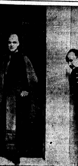
Hon. G. Howard Ferguson TORONTO, Feb. 21.—(CP)—Death came today to blurb George Howard Ferguson, who devoted 33 of his 76 years to public life in his native Ontario and won the reputation of being one of the most sagacious political strategists in the Province's history.

MOSCOW, Feb. 21.—(AP)—Pravda asserts today that Prime Minister Mackenzie King was only attempting to minimize the failures of Foreign Secretary Bevin of Britain at the United Nations Security Council when he announced secret information that Canada was a foreign embassy, later identified as Russian, in Halifax.