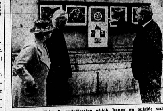
Page from "Echoes" rededication which hangs on outside wall of Church.

And to-day Canada is represented in this historic and hallowed church. A Canadian Ensign hangs there and a pew (on the door of which the Canadian Coat of Arms are emblazoned) has been dedicated to the Imperial Order Daughters of the Empire. Here will be welcomed the Order's young War Memorial students in London, visiting members of the Order, and other Canadian overseas, who may come to worship and rest awhile.