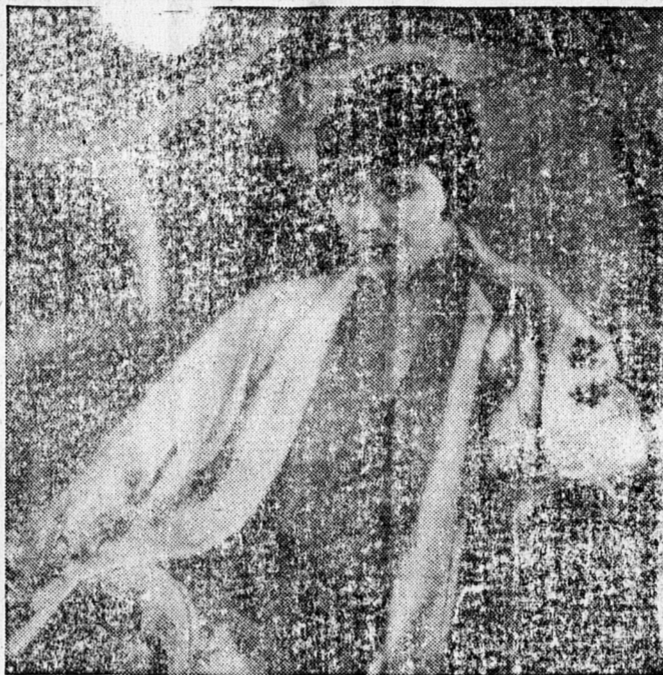
LOUISE BROOKS, BEAUTIFUL FILM STAR,

wears this silk lounging suit, typical of pretty clothes shown in her pictures. "I learned by experience," she says, "that only Lux keeps that new look in clothes." . . . That is why women everywhere—8 out of 10 in representative homes in cities from coast to coast, investigations show, use Lux!