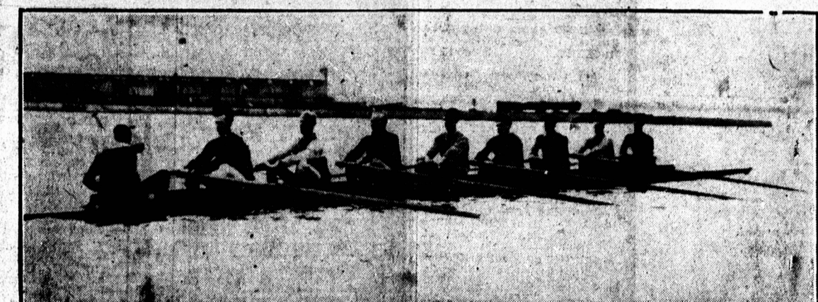
Here they are! The University of Toronto rowing crew, champions of Canada, and likely Olympic contenders, are shown on Toronto Bay, where they have been practising ever since the ice broke.