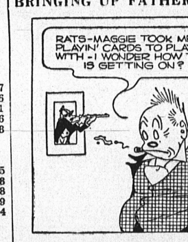
THE KING STOOPS