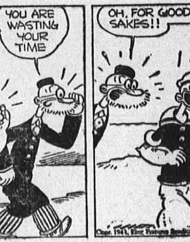
THE KING STOOPS