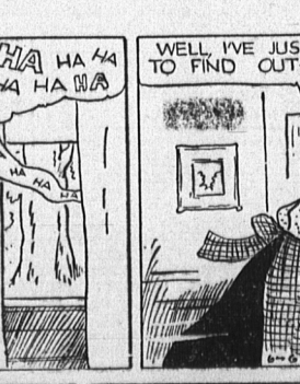
THE KING STOOPS