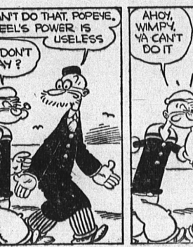
THE KING STOOPS