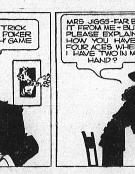
THE KING STOOPS