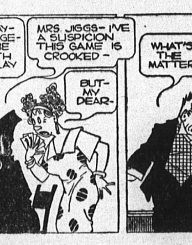
THE KING STOOPS