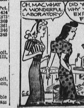
THE KING STOOPS