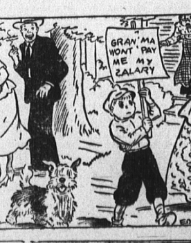
THE KING STOOPS