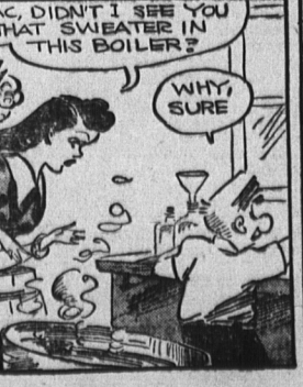
THE KING STOOPS