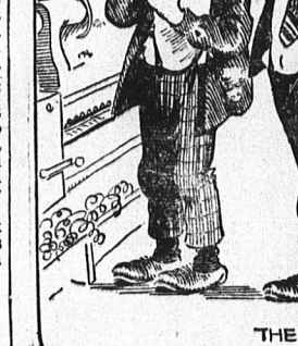
THE KING STOOPS