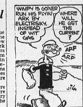
THE KING STOOPS