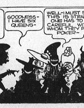
THE KING STOOPS