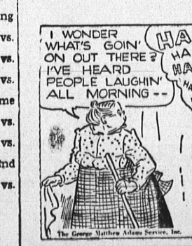
THE KING STOOPS