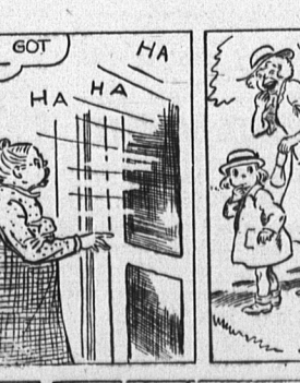
THE KING STOOPS