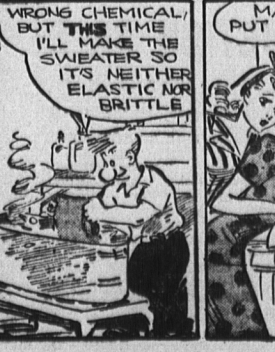
THE KING STOOPS