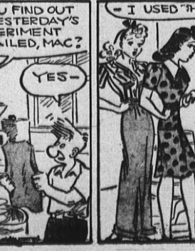
THE KING STOOPS