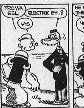
THE KING STOOPS