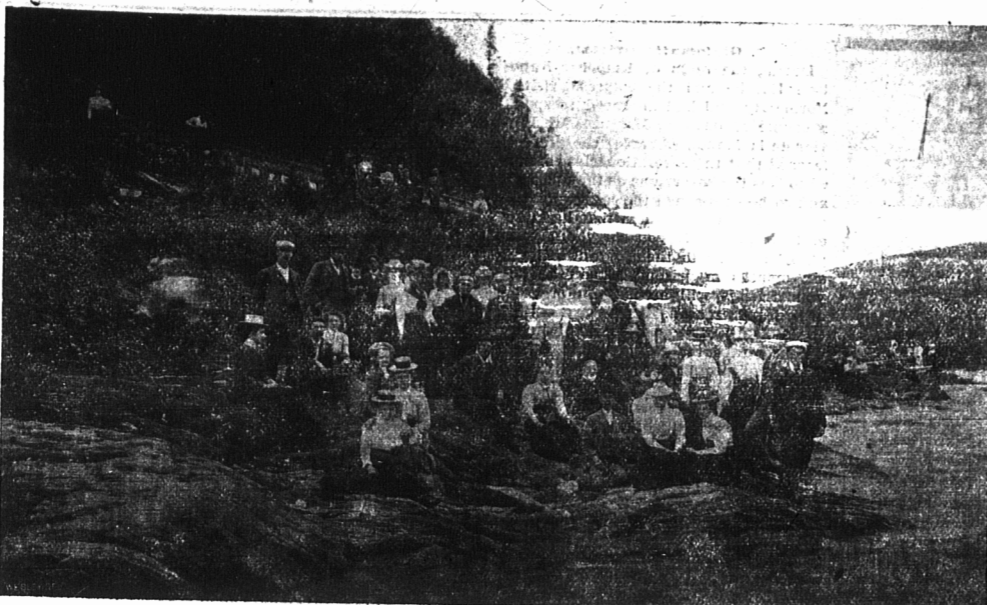
A SUMMER SCHOOL OUTING [Taking a holiday at the Famous Metapedia.]

For Sale by AULD BROS. Wholesale Agents for P. E. Island.