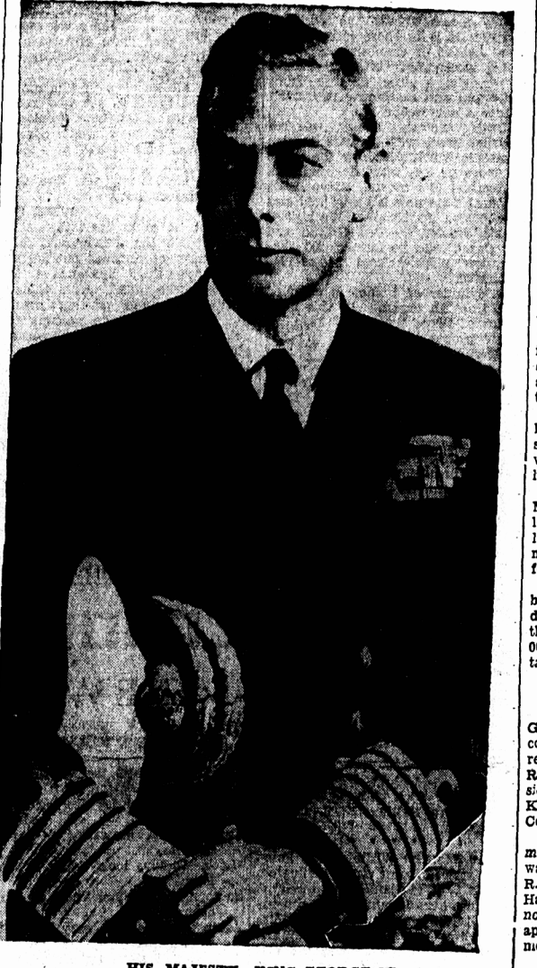
HIS MAJESTY KING GEORGE VI