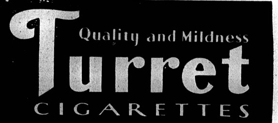
Imperial Tobacco Company of Canada, Limited

today. The House was in committee of supply with the estimates of the Interior Department under review. The facilities in the hospitals of Canada for dealing with cancer were inadequate, Mr. Campbell said, due to lack of radium. The cost of this was $70,000 a gram; and at present only one pound of radium was available in the whole world. Of this amount Canada possessed sixteen grams. One of the recommendations of the Ontario Government Commission which had enquired into this matter was that the Federal Government appoint a radium commission to control the distribution of radium. Mr. Campbell told the House that Belgium produced 95 per cent of the world's supply, and its distribution was controlled by a trust, with the result that the price was maintained at an exceedingly high level. Deaths from cancer in Canada rose from 88.7 per 100,000 of population in 1927 to 93.3 in 1930; and in the United States the deaths from the same cause rose from 63 per 100,000 in 1900 to 96 in 1930. Mr. Campbell said there was every reason to believe that sufficient radium for the world's use was in the Great Bear Lake area. It was the sacred duty of Canada, not only to her own people but to suffering humanity throughout the world, to prevent this radium supply from falling into private hands