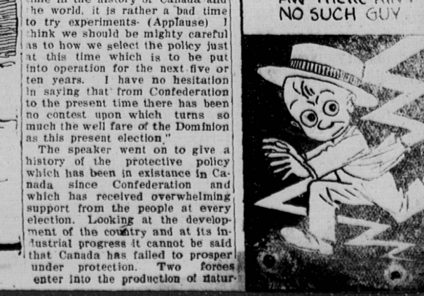
QUICKER 'N LIGHTNING! AW THERE AINT NO SUCH GUY.