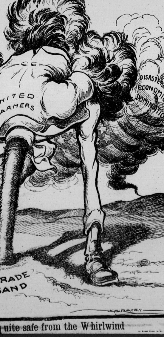
He thinks he will be quite safe from the Whirlwind