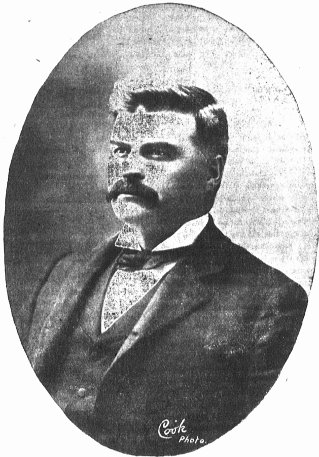
HON. JAMES H. CUMMSISKEY, Minister of Public Works.

bushed. He said the Inspector had stated that the ice had been properly bushed. The Opposition had voted against the different taxes proposed by the Government. They wanted to kill all the taxes except those on farmers. The Government was one of farmers and they would protect the farmers' interests. The Conservatives went out of power with a big deficit and an overdrawn bank account, and with withdrawal of capital, interest etc the debt Premier expects to receive a million. The Premier expects to receive $90,000 for a re-adjustment of the subsidies and other large claims. The Opposition had taken a most unfair ground with reference to the fishery bounty. The resolution and the statute passed in 1882 by the Dominion Government did not state that the $150,000 granted was in lieu of interest. For four years he had been associated in the Government and this was the first time he had spoken on the Bud-