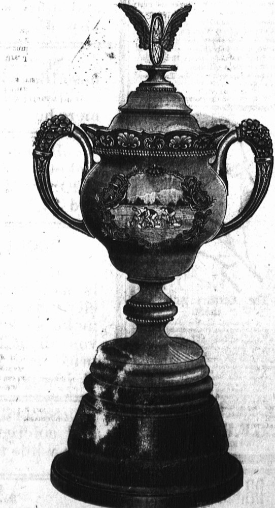
The above is an exact illustration of The Guardian's Bicycle Trophy to be competed for this year. It stands 24 inches high and has but to be seen to be admired. The course is sixteen miles as already outlined in these