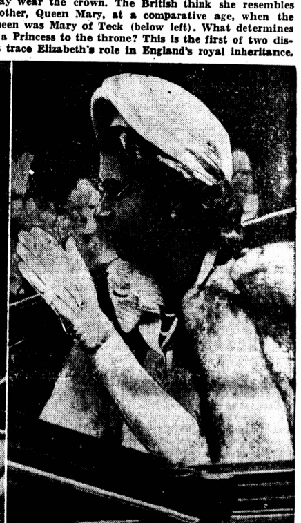
HERESSES PRESUMPTIVE: Dowager Queen Mary was a princess in left photo. The British see a strong resemblance—and their next Princess Elizabeth, who rides in the barouche when she rode in the barouche Queen—in Mary's granddaughter.

George VI rules is the Act of Settlement, passed by only one vote in the House of Commons and given Royal Assent in 1701.