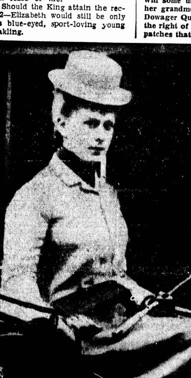
HERESSES PRESUMPTIVE: Dowager Queen Mary was a princess in left photo. The British see a strong resemblance—and their next Princess Elizabeth, who rides in the barouche when she rode in the barouche Queen—in Mary's granddaughter.

To Visualize Elizabeth as Queen, Look at Princess Mary of Teck... In the chamber of the House of Commons, less than a month before her wedding, Princess Elizabeth sat in a small throne at the right of her father, King George VI. Even without this ceremony, the British have had little doubt that Elizabeth will some day wear the crown. The British think she resembles her grandmother, Queen Mary, at a comparative age, when the Dowager Queen was Mary of Teck (below left). What determines the right of a Princess to the throne? This is the first of two dispatches that trace Elizabeth's role in England's royal inheritance.