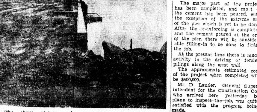
The above pictures show two views of the Railway Wharf as it appears today.

At the present time between 25 and 30 workmen are engaged in re-inforcing the west wall and the wharf face proper. This additional buttressing will delay completion of the project some six weeks, it is believed.