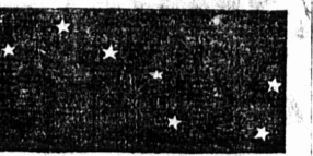
Which direction is the North Star?