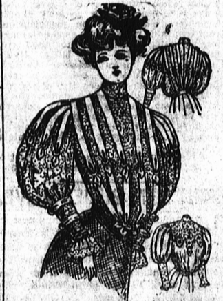
LADY'S WAIST, CLOSING IN BACK WITH OR WITHOUT RANGY YOKE AND WITH OR WITHOUT A LINING. (No. 3146)

The illustration shows a most attractive production in pale blue Lansdowne, elaborated with suspender strappings of Point Venice lace. The waist proper is built along very simple lines. A tight fitting gives support and is fitted by shoulder and underarm seams and with feather-boned darts at front. The sleeves are gathered very full at the armhole and form a moderate puff at elbow, where they join a deep cuff trimmed with lace and ribbon and edges with a lace frill. A yoke empiement, with lower edge cut in battlement tabs, forms part of the pattern and will be preferred by many to vary the decoration. The pattern is an excellent one for use in making up the ready embroidered waist lengths; also for waists of all over embroidery or lace. Its adaptability to a wide range of fabrics and methods of trimming make this pattern an excellent standby for both dressmakers and home sewers. For sheer effects in lawn, organdie, swiss or dimity the lining should be omitted. Taffeta, surah, mohair, cashmere, flannel or fine serge may be lined or not as preferred. The pattern 3146 is cut in sizes 32, 34, 36, 38, 40, and 42 inches bust measure and requires 2 1/2 yards of 36-inch material, with 2 yards of lining and 9 yards of lace to trim as illustrated or a yard of contrasting material for yoke and deep cuff.