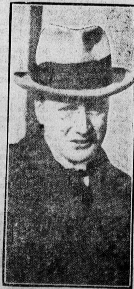
St. John Ervine, noted English theatre critic, took a look at the shows in this country and then remarked: "Brains for the stage instead of dimpled knees." Competition between good looks and brains is criminal, he thinks