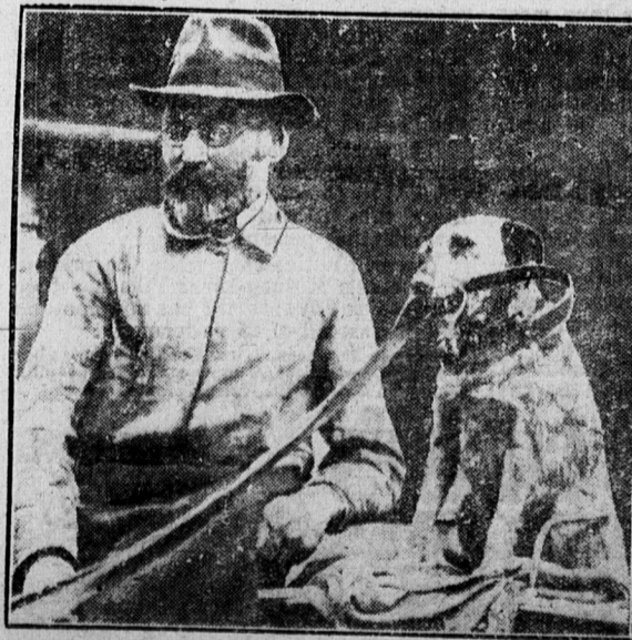
One of the smartest canines in Great Britain is owned by a Sussex butcher. The dog takes his master's invoices and messages to the various customers' houses and frequently drives to market, as shown above