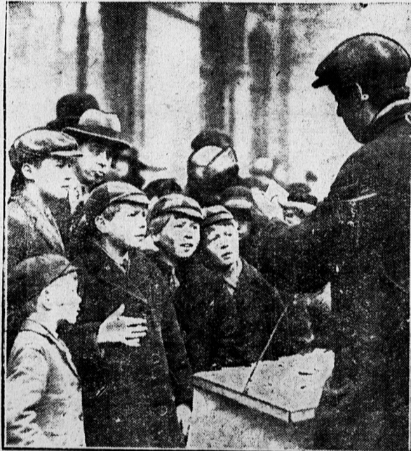
Here's a splendid study in expressions. Old and young take keen interest in a new Christmas puzzle being demonstrated by a hawkler in London