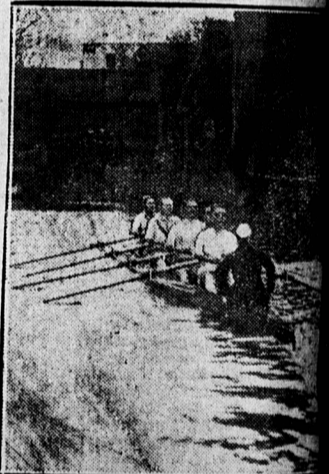
Here is the winning "A" crew in the eights, leaving Appleby's yard