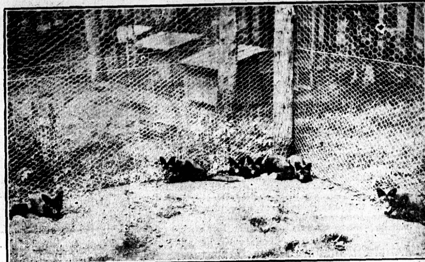
This picture shows a litter of black foxes at the Vimy Ranch at Charlottetown of McLure and McKinnon.