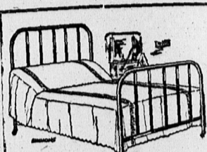
WALNUT FINISH STEEL BEDS $7.45

Walnut finish steel beds as picture, baked walnut finish which will not chip. Single medium and double beds. Freight paid. Special ..... $7.45