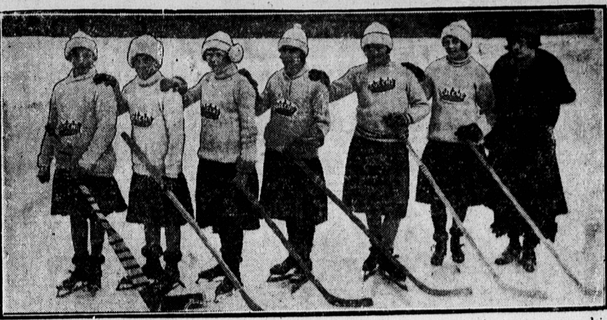
This girls' hockey team of Toronto, all fourteen years and under, are playing games which show puck-chasing ability that is the envy of the boys. They call themselves the Queens