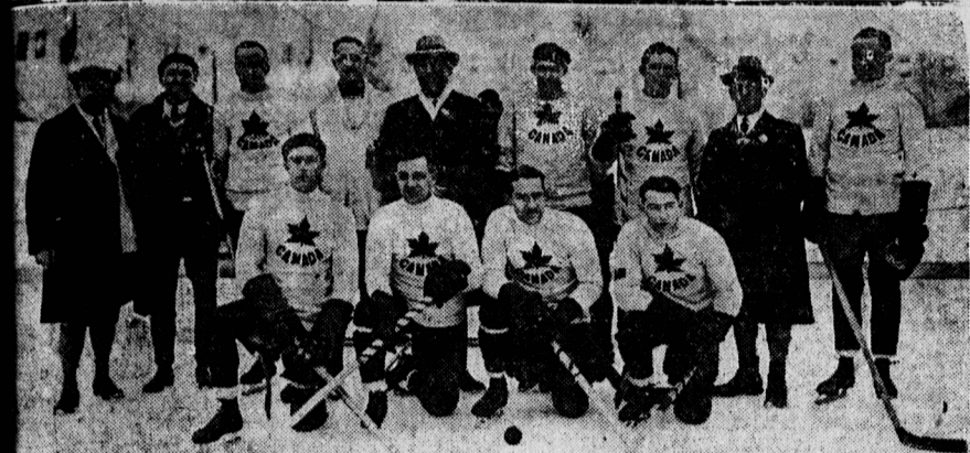
Photograph shows the Canadian hockey team after they had been acclaimed the champions of the world, by virtue of their beating every opponent in the Olympic contests at Chamonix, France.