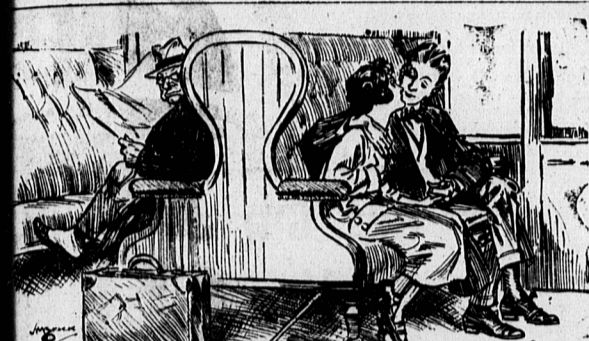
Sweet Young Thing: "Ah! has unis ickie woogleums a kiss for a sweetie lovums?" Bachelor Passenger: "Curse the se derned foreigners!" -From the Passing Show.