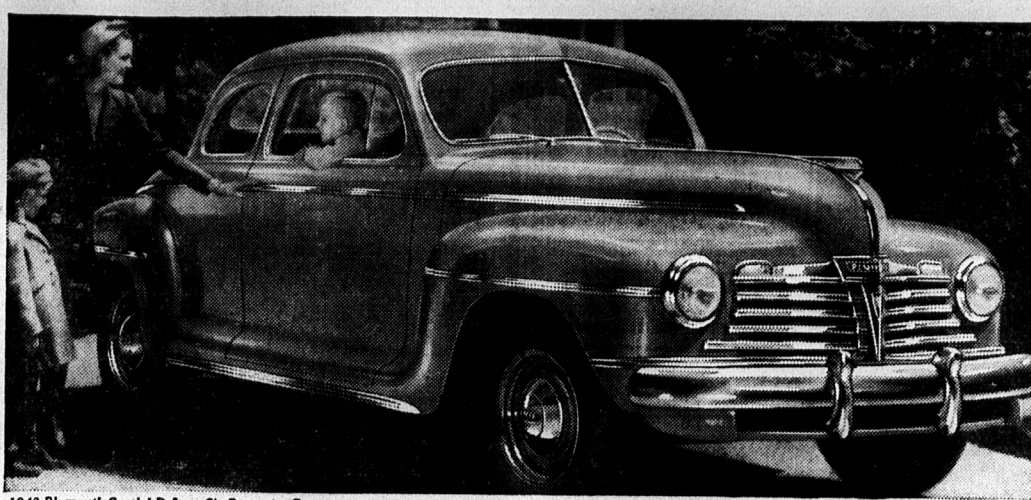
1941 Plymouth Special DeLuxe Six-Passenger Coupe.

Plymouth's Finest is massive, commanding, low-slung, long and wide. The engine is a full 95 horsepower, with new economy. It's your Wise Buy!