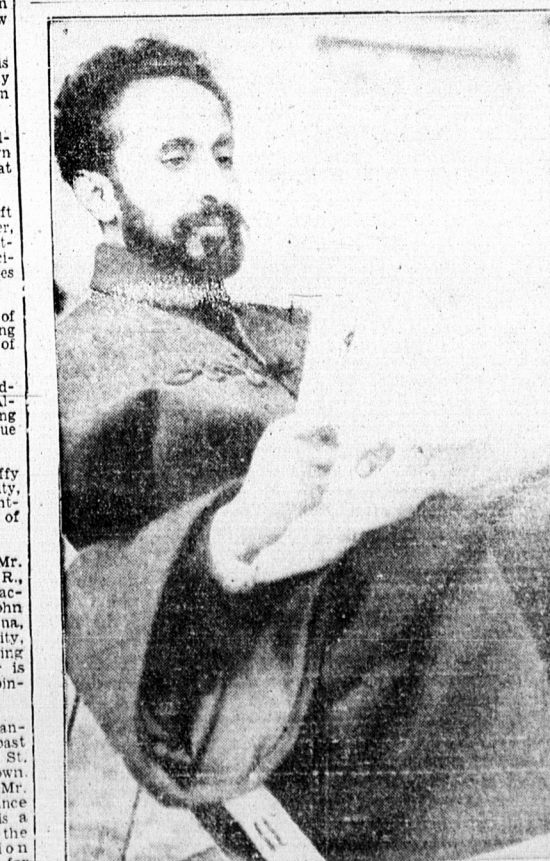
Keeper of the nearly empty treasury of Haiti Selassie has hopes of replenishing it because the former Emperor of Ethiopia has won a judgment in chancery for $35,000 against Cable and Wireless Ltd., which he claimed under an agreement for radio and telegraphic service between Addis Ababa and London.

YOUTHFUL SKIRTS Skirts are almost as varied. There is the swinging, all-pleated skirt—accordion or box-pleated—which is very hard to resist because it is so youthful, but which is full of pitfalls for the unwary for this very reason. Only the slimmest, long-legged type can wear a skirt like this well.