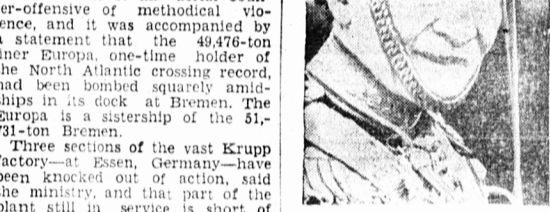
CHIEF SCOUT ILL