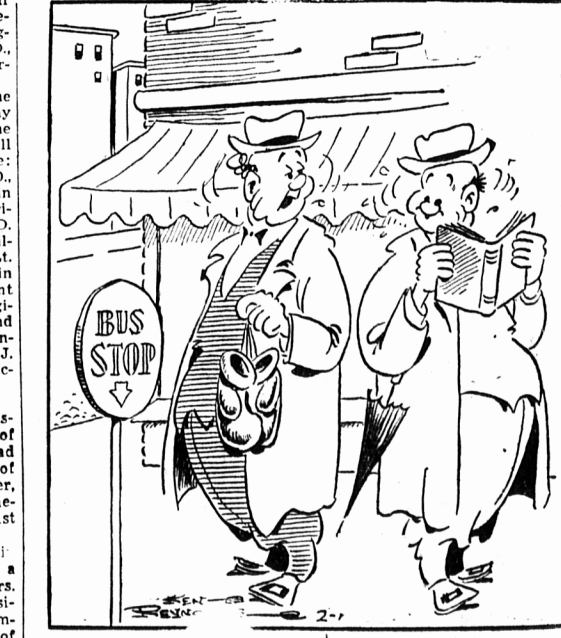
"I almost forgot my wife's wedding anniversary - until I saw these boxing gloves in the Guardian Want Ads!"