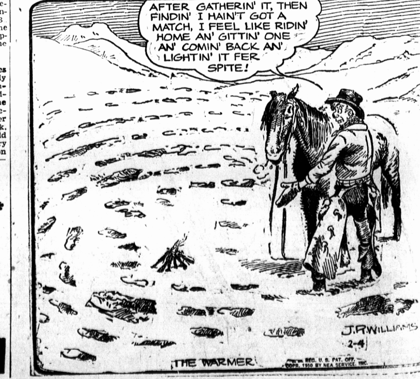
AFTER GATHERIN' IT, THEN FINDIN' I HAIN'T GOT A MATCH, I FEEL LIKE RIDIN' HOME AN' GITTIN' ONE AN' COMIN' BACK AN' LIGHTIN' IT FER SPITE!