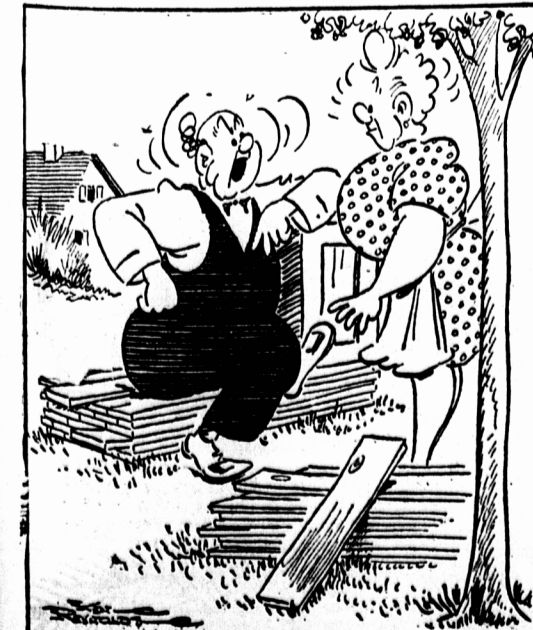
You should have gotten this unfinished furniture with a Guardian Went Ad — then it wouldn't have been quite so unfinished!