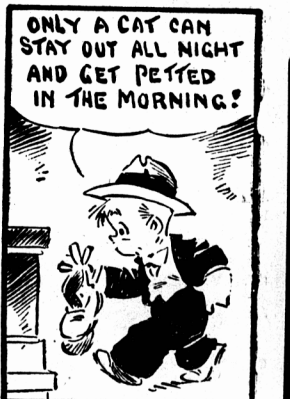
ONLY A CAT CAN STAY OUT ALL NIGHT AND GET PETTED IN THE MORNING!