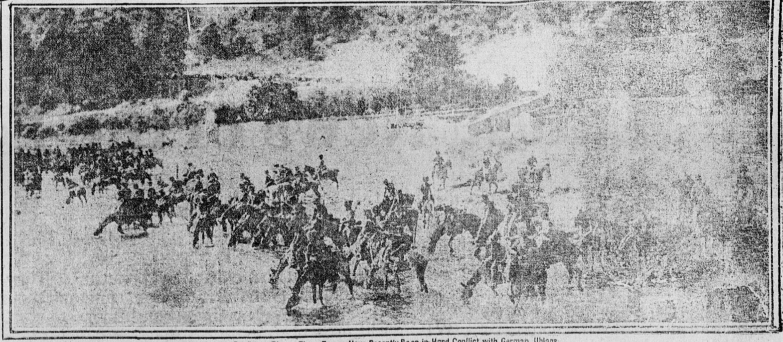
Belgian Cavalry Fording a River. These Troops Have Recently Been in Hard Conflict with German Uhlans.