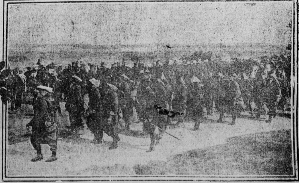
French Infantry Advance.