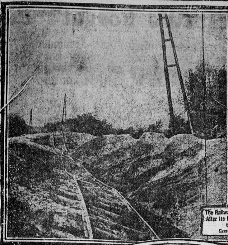
The Railway Line from Saint Tread to London After its Destruction by the Belgians to Prevent the Germans from Advancing.