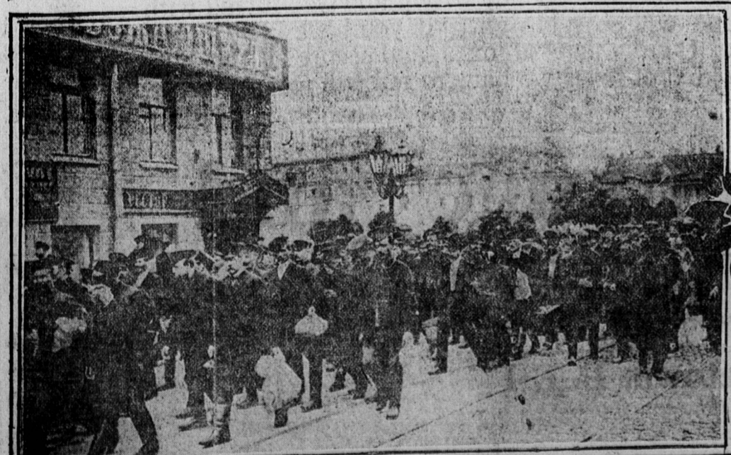
Russian Reservists, Accompanied by Tearful Wives, Fathers and Sons, Off to Join the Russian Troops.