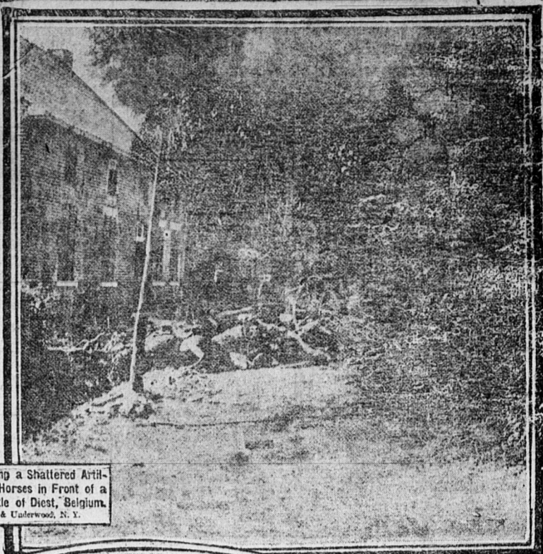
A Scene of Carnage Showing a Shattered Artillery Carriage and Dead Horses in Front of a Farm House After the Battle of Diest, Belgium.