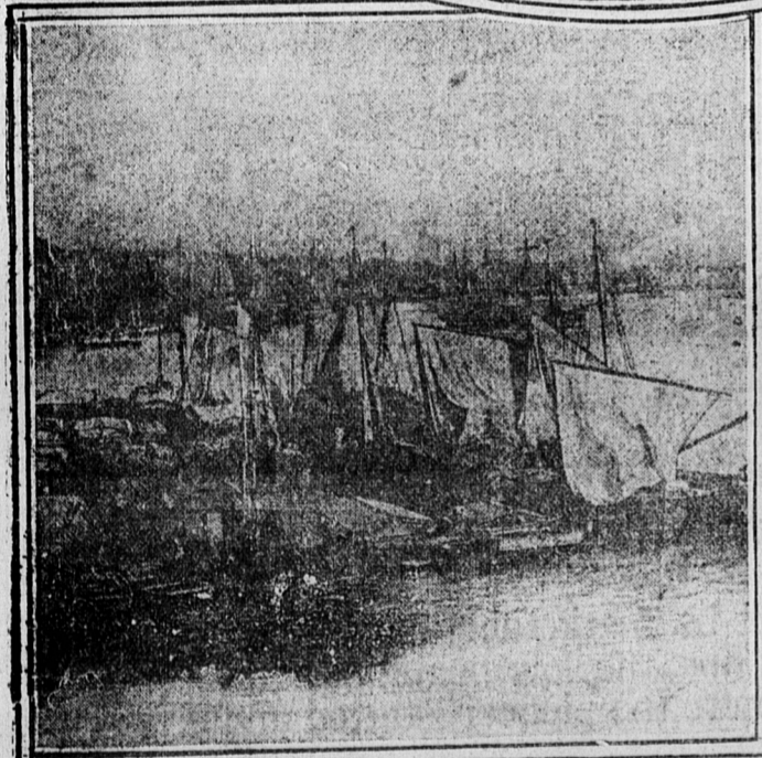
A View of Bordeaux, the New French Capital, from the Bridge.